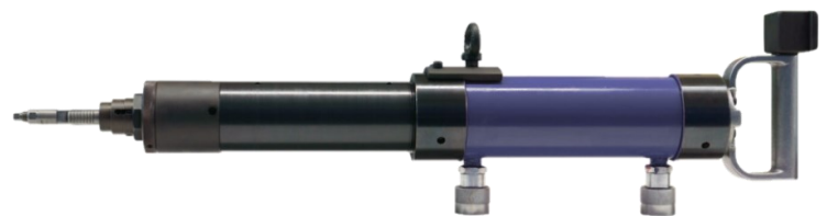
Stub Pulling Ram