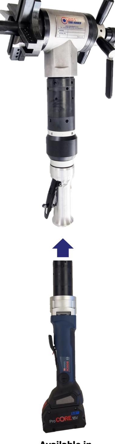
Available in 18V Cordless

+44 (0) 23 8036 6410 tuberunner@bsa-regal.co.uk