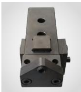
Special jaw set for levelling and centering on a flange